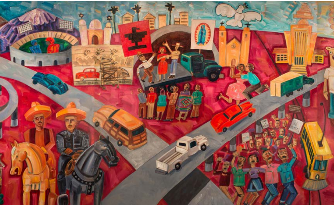
Detail from A History of the Chicano Movimiento , 1998, acrylic & graphite on canvas, Carnegie Art Museum Collection