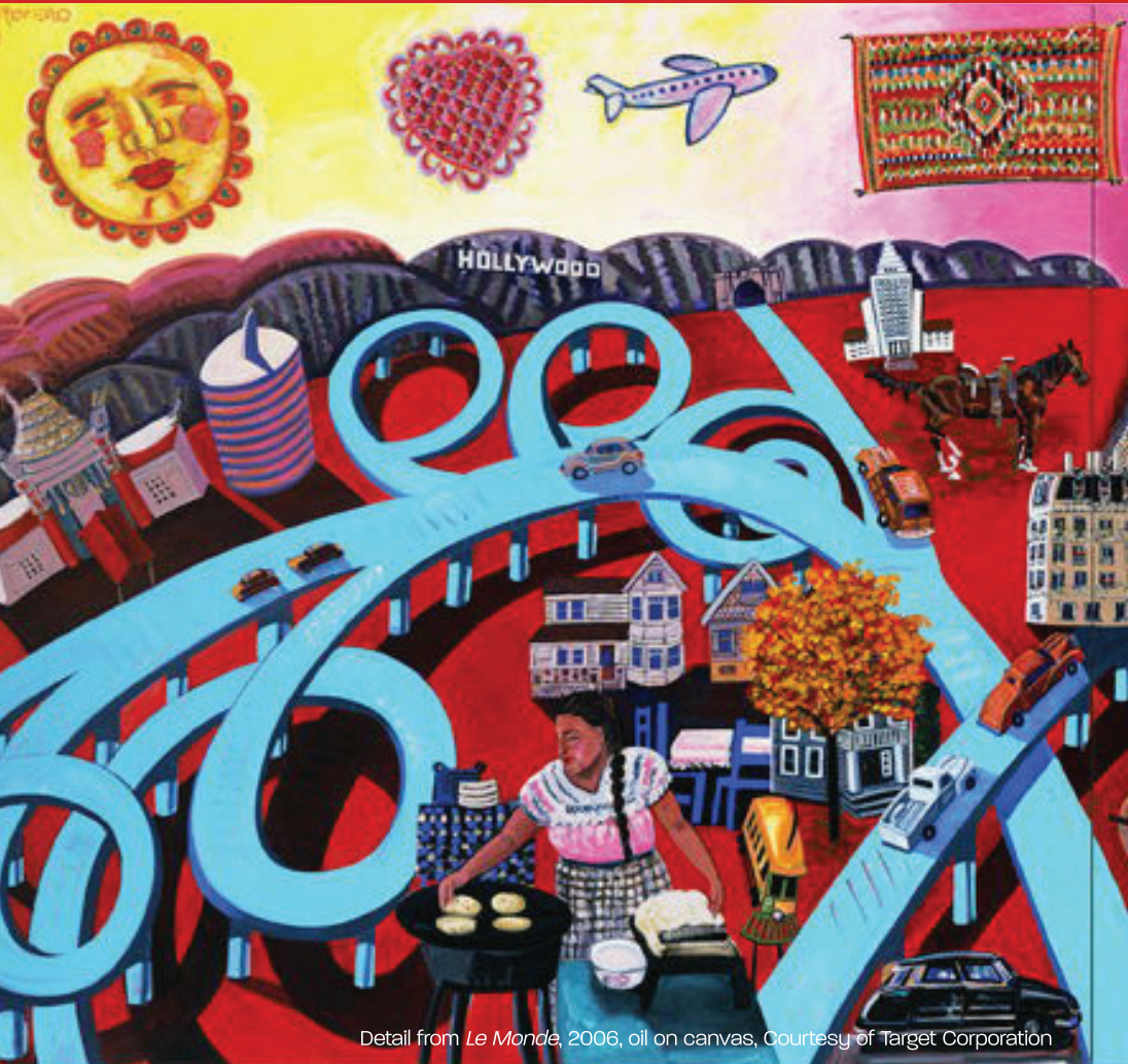
Detail from Le Monde , 2006, oil on canvas

FRANK ROMERO was born in 1941 and grew up in Boyle Heights, a community on the East side of Los Angeles. Frank watched his environment transform as the population grew. Victorian homes were replaced with tract housing and skyscrapers, while stacked freeways with winding interchanges sprang up where parks used to be. Today, the Boyle Heights neighborhood is bordered by no less than five freeways. His landscapes illustrate a changing Los Angeles, shown through the lens of personal experiences and political events that affected him as a Chicano artist.