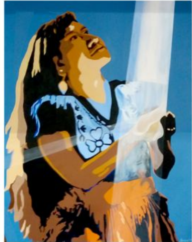
Building Bridges Mural Panel 4 La Luz/ The Light

A woman receives light into her hands, as it reflects into other directions. This final panel symbolizes the power of women to create life, shelter and safety. In depicting her we conjure up notions of home and hearth, affirming basic human rights, traditional beliefs, inquiry and investigation.