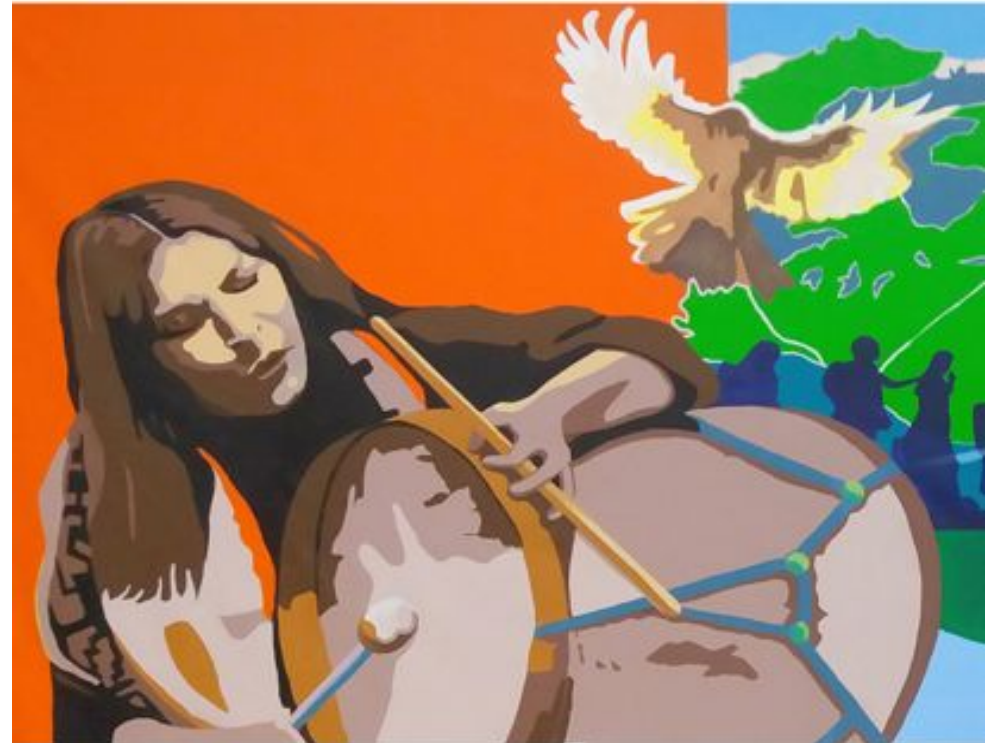
Building Bridges Mural

Panel One- Nueva Cancion, Pacha Mama, 'New Song, Pacha Mama.' The New Song movement includes folk traditions, ballads and protest songs. A hybrid music genre, it celebrates commitment and social equality, continues to played an integral role in social struggles. The figure represents the Pacha Mama creative energy that sustains life on earth. Her spirit runs through the Andes Mountains depicted in the mural