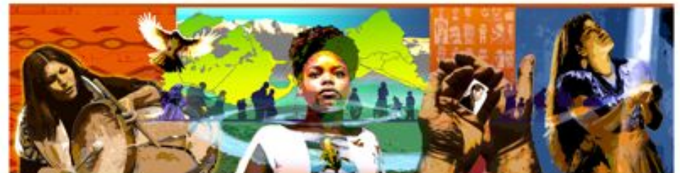
Panel 1 Nueva Cancion/ New Sing