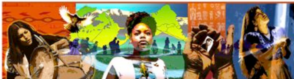
Panel 3 Los Desaparecidos/ The Disappeared