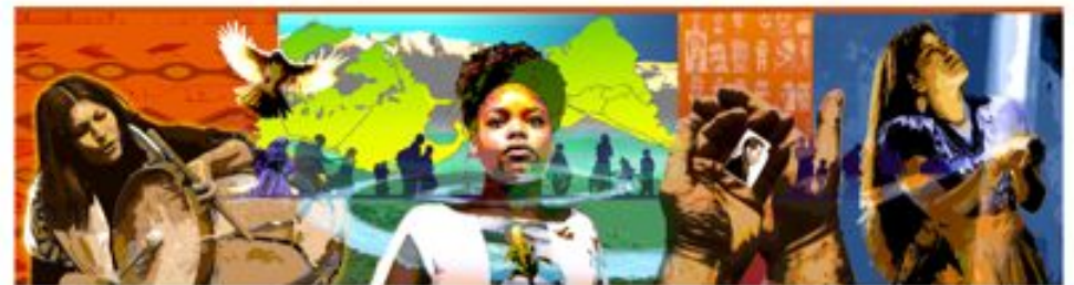
Panel 2 Corazon de Todo/ Heart of it All