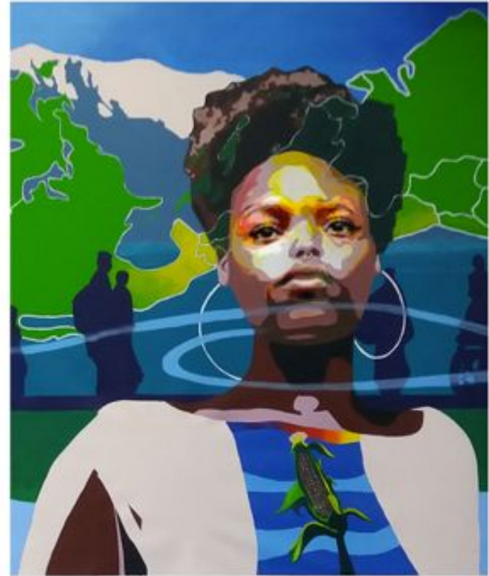
Building Bridges Mural

The white dove between panels symbolizes more than peace, in the mural it also contains the idea of justice and dignity. Against the background map of the Americas a train of refugees is depicted in movement towards the central figure of an Afro Latina woman. The figure symbolizes the path of identity and belonging, representing immigrants and travellers. A river flows around her to symbolize our growing negotiation with the earth and ourselves during a time of climate change.