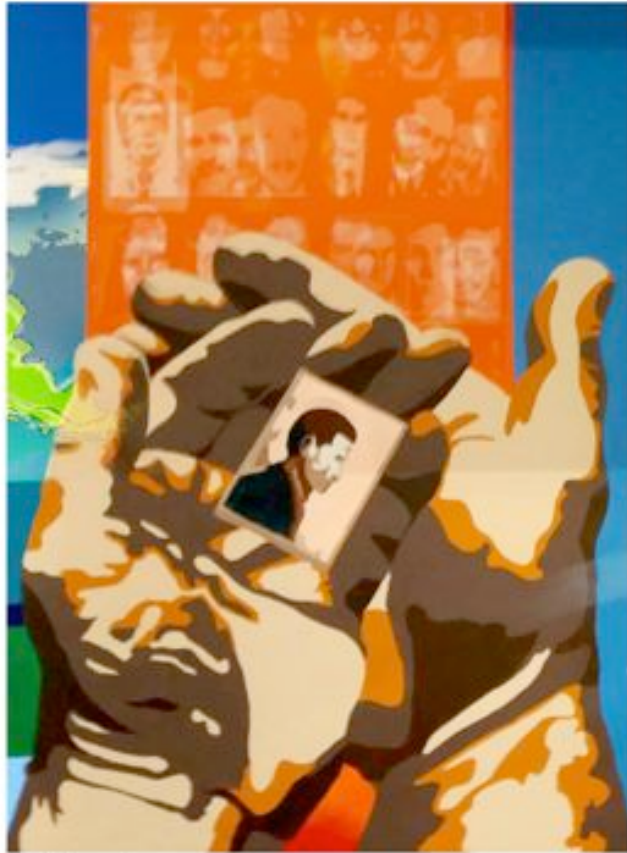
Building Bridges Mural