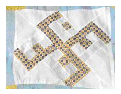
Figure 11. Views of the "Flying F" quilt top, ca. 1930, owned and photographed by Willow M. Pittman Figure 12. inset of larger quilt top