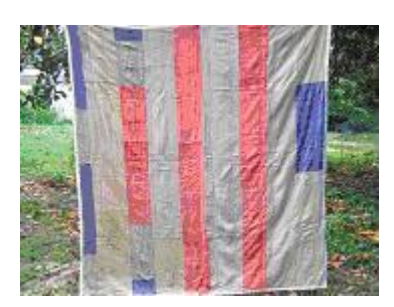
Figure 7. Helen McCloud, ca. 1965, "Blocks and Strips, Tied With Yarn" with permission of Tinwood Media. Figure 8. Unknown maker, "Strips in Blue and Rose", Alabama, ca. 1930, photographed and owned by author