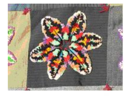
Figure 4. Lucy T. Pettway, 1981, "Birds in the Air" used with permission of Tinwood Media Figure 5. Maker Unknown, 1948, "Starfish Blocks" embroidered from author's collection

Figure 6. Close-up of Figure 2; single block from author's collection