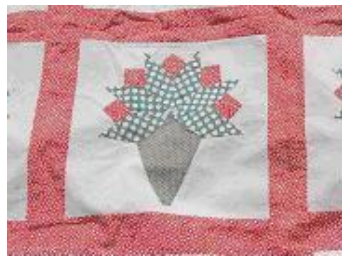
Figure 18. "Nosegay in Blocks", 1940s, Louisiana, maker unknown.