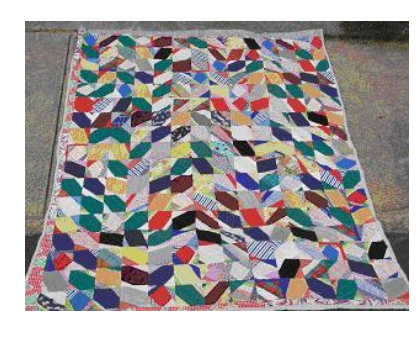
Figure 19. Inset of quilt of figure 18