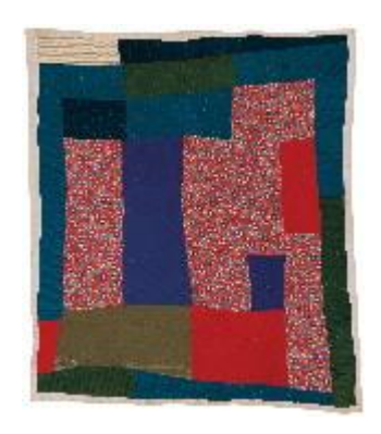
Figure 3. Amerlia Bennett's "Blocks and Strips," 1950's, is used with permission from Tinwood Media