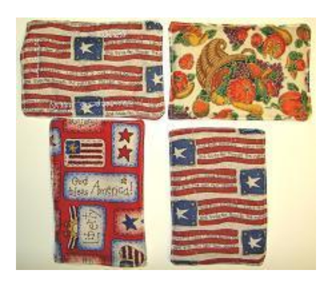
Figure 27. Postcard by Feldman. <a href="http://www.fabric-postcards.com/images/ChristmasPics/feldman10.jpg/">http://www.fabric-postcards.com/images/ChristmasPics/feldman10.jpg/</a> Used with the express permission of Penny Halgren, creator of Penny's Postcard Posse.

Figure 28. Postcards by Bonnie. <a href="http://www.fabric-postcards.com/images/ChristmasPics/bonnie001-1.JPG">http://www.fabric-postcards.com/images/ChristmasPics/bonnie001-1.JPG</a> Used with the kind permission of Penny Halgren, creator of Penny's Postcard Posse.